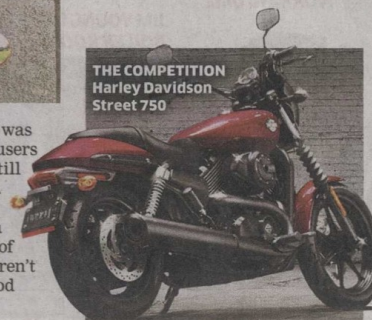
THE COMPETITION Harley Davidson Street 750

With that engine going and it is generating a lot of cash for us, we now move into a new trajectory, which is becoming a global player.