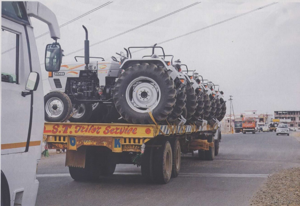
26 December 2014 / Outlook BUSINESS