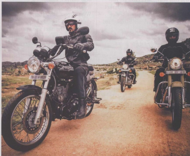
26 December 2014 / Outlook BUSINESS

In fact, VECV seems to be the only slow mover in the Eicher shed. Though it enjoys a 34% market share in the light and medium duty truck segment at the end of Q3CY14, its overall share in truck and bus market is stagnant at 12%. All that is set to change with the latest Pro range of trucks and buses VECV launched last year, the first few models of which were rolled out in early 2014. “A lot of serious investment has gone into this product, its technology and capacity. Now, we are waiting for the market to revive,” says Malik, with Lal adding that Eicher “can disrupt this market.” Aided by Volvo’s technological might and Eicher’s low-cost manufacturing capability, analysts believe the Pro range of trucks will drive market share gains for VECV over the medium term. “However, it is not possible for one company to capture a large share in a short period of time. VECV’s growth will be gradual as its competitors are also modernising their offerings,” cautions George. That note of caution doesn’t worry Lal. It took two decades of self-belief and hard work to get Royal Enfield the much-needed escape velocity and he seems prepared to wait for Eicher’s trucks and buses to follow suit. ☺