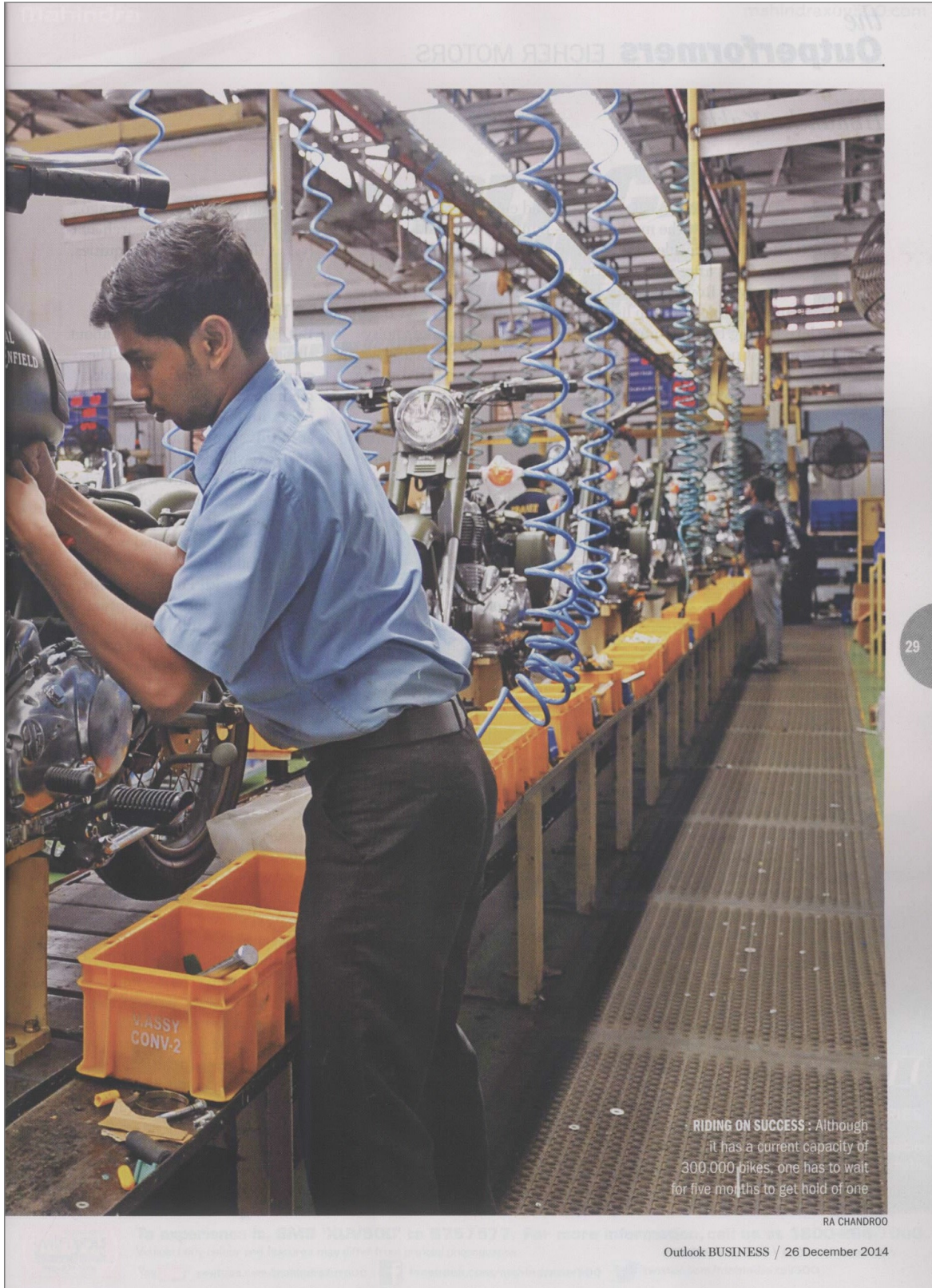
RIDING ON SUCCESS : Although it has a current capacity of 300,000 bikes, one has to wait for five months to get hold of one

News monitored for: VE Commercial Vehicles